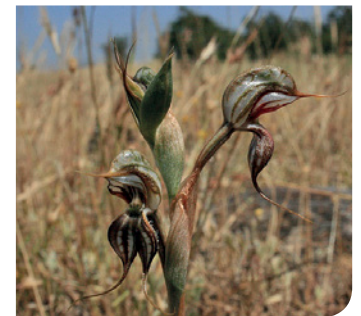
Basalt Rustyhood

confirm our approach to avoid, minimise or offset any potential effects if the species is present.