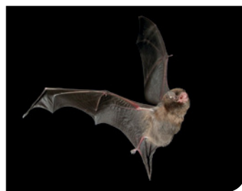
Southern Bentwing Bat

Planning has determined that an Environmental Effects Statement is not required, so long as we undertake additional assessments for two species; the Southern Bentwing Bat and the Basalt Rustyhood orchid.